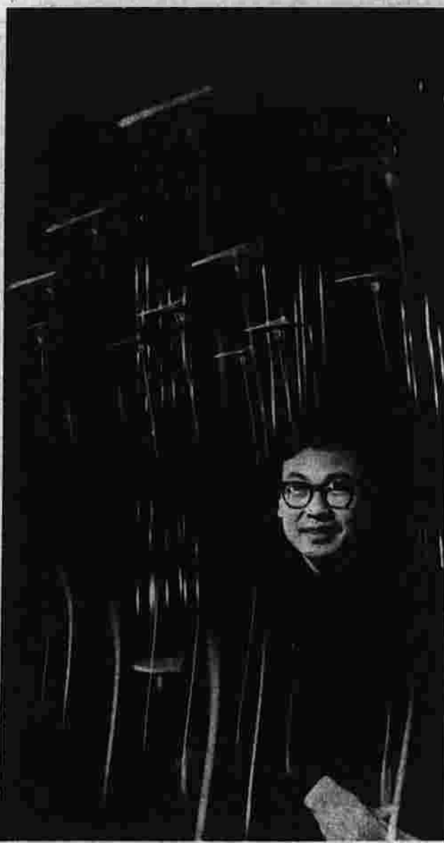
Sculpture of vibrating steel wire by Wen Ying Tsai in look at art on "21st Century." Sunday at 6 p.m.