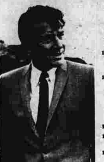
Efrim Zimbalist Jr., stars in ABC's 'The FBI,' Sunday 8-9 p.m.