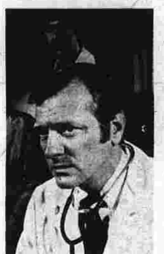
George Grizzard in drama, "The Choice," on NBC's "Prudential's On Stage," Sunday 10-11 p.m.