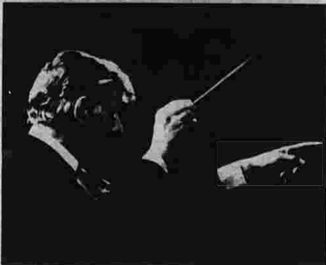
Leopold Stokowski, top, joins Leonard Bernstein to direct Bach program Sunday 4 to 5 p.m. on CBS.