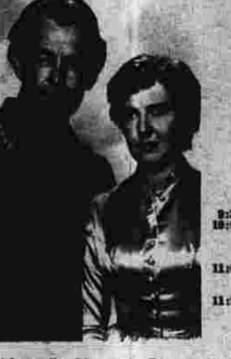
Alan Ladd and Jean Arthur in the film, "Shane," Sunday 9-11:15 p.m.