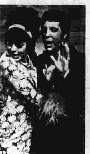
Tom Jones and Jo Anne Worley on ABC's "This Is Tom Jones," Friday 7:30-8:30 p.m.