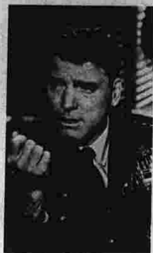
Burt Lancaster in the movie, "Seven Days in May," Thursday 9-11:20 on CBS.

caped criminal in a barn and believes that he is Christ. Hayley Mills, Bernard Lee, Alan Bates.