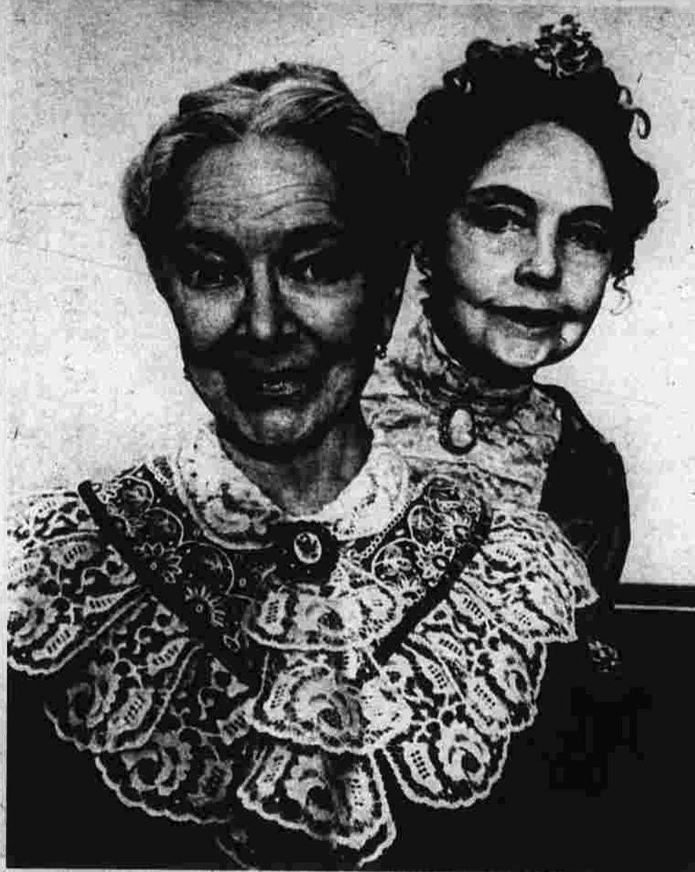
Helen Hayes and Lillian Gish in TV adaptation of "Arsenic and Old Lace," Wednesday 9 p.m. on ABC.